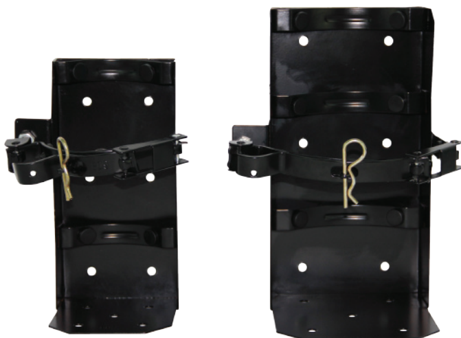
PSE40-065 Marine/Vehicle Bracket 10lb